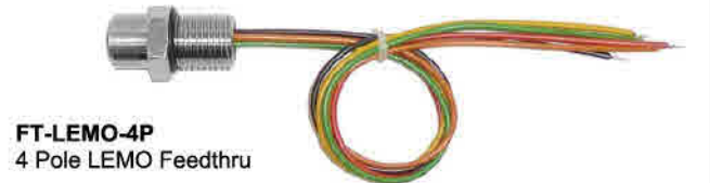
FT-LEMO-4P 4 Pole LEMO Feedthru