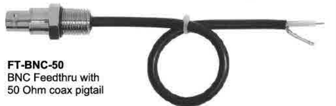
FT-BNC-50 BNC Feedthru with 50 Ohm coax pigtail