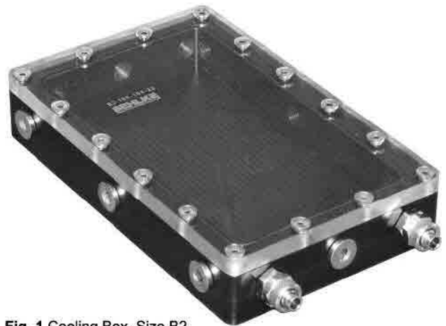
Fig. 1 Cooling Box, Size B2

The standard housings are made from Delrin and Makrolon. PEEK, PVC and Aluminum are optionally available.