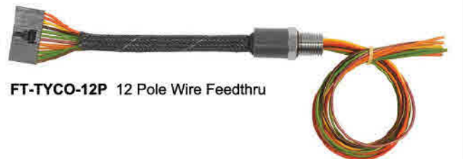
FT-TYCO-12P 12 Pole Wire Feedthru