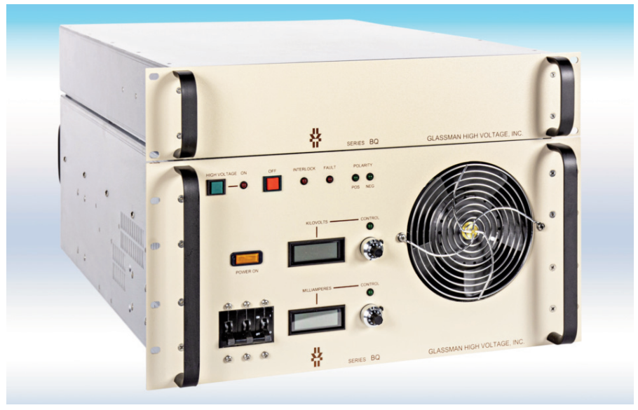
Models from 0 to 15 kV through 0 to 100 kV, 12.25" H x 19" W x 24.0" D, 88 lbs.